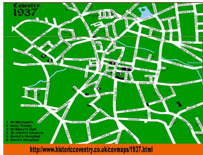
Illustration 1 - Coventry as at 1937