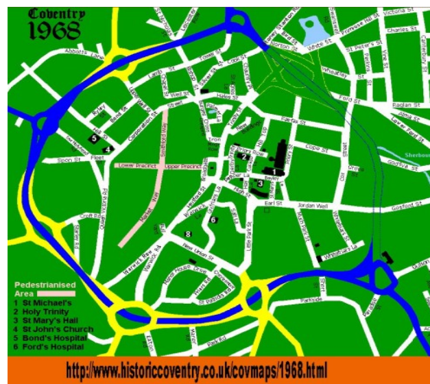
Illustration 3 - Coventry as at 1968